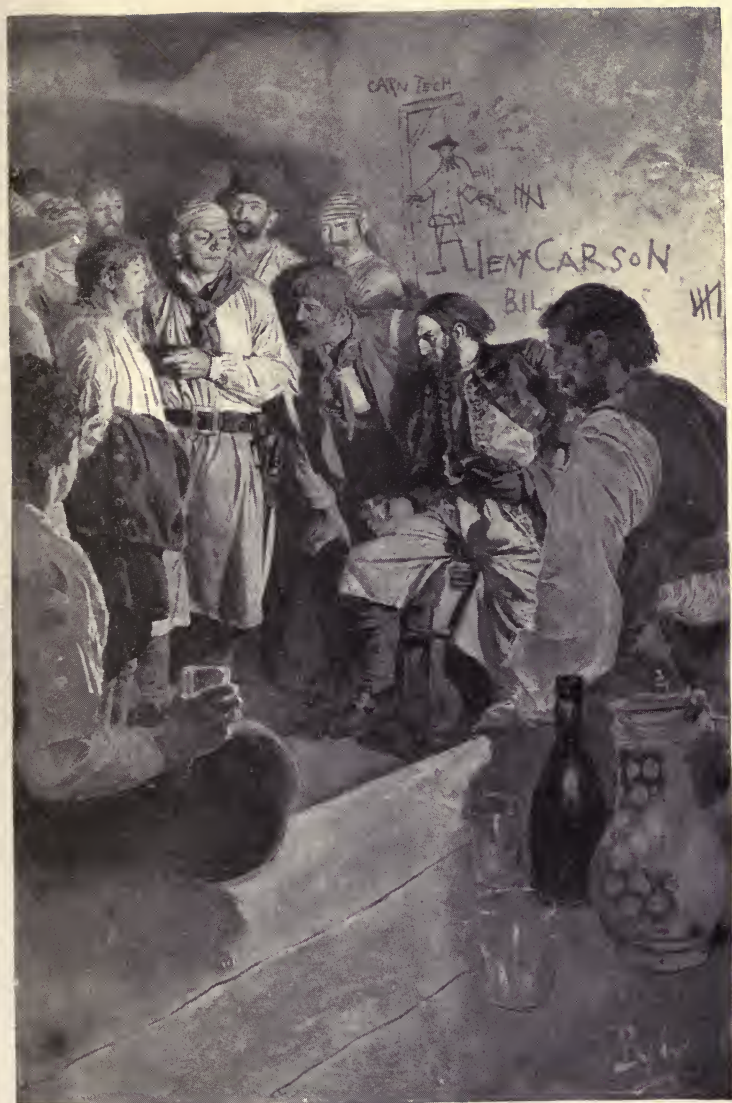
"HE LED JACK UP TO THE MAN WHO SAT UPON A BARREL."